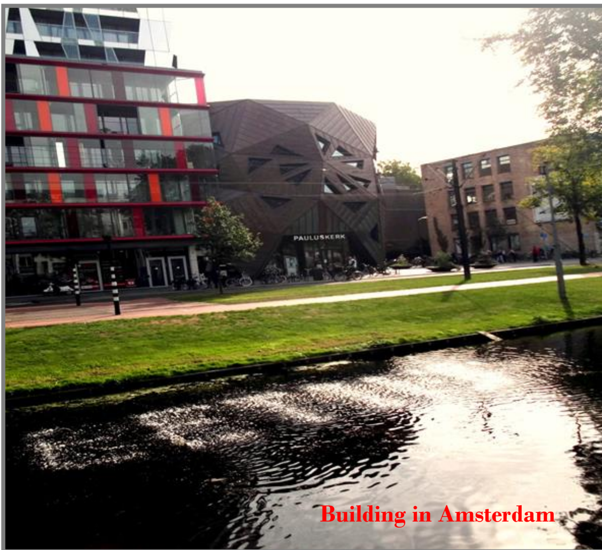
Building in Amsterdam

The thriving city of Rotterdam with outstanding architecture and a well-organized staff convened the 10 th International Conference for Nurse Practitioners/Advanced Practice Nurses of the International Council of Nurses. This is the second time that this conference was held in the Netherlands. In 2004, we celebrated the 3rd INP/APN Network conference in Groningen, Netherlands, located in the northern part of the nation. At that conference we had attendees representing twenty seven nations and, 289 representatives. This year, in 2018, fifty seven nations were represented and an excess of 1,600 delegates attended the event. YES, we are growing internationally!